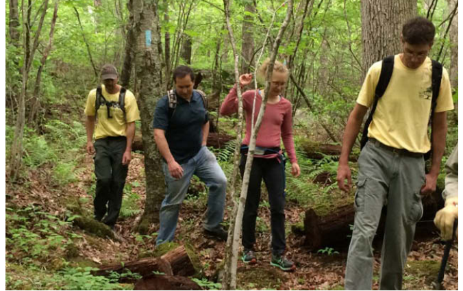
Right: Hiking Through A Tight Spot