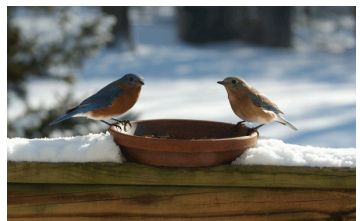
Banjie Nicholas: Blue Birds