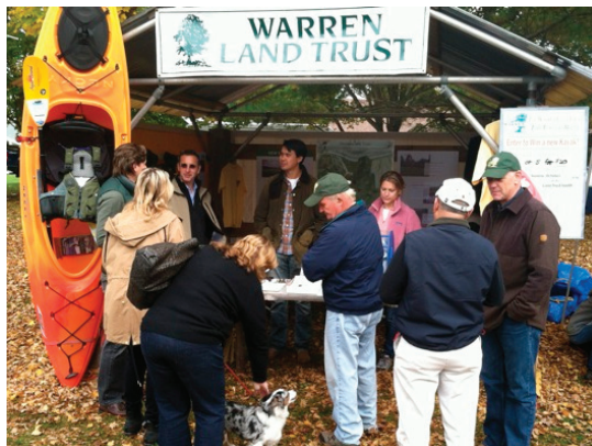
Working the booth

In an autumn characterized by unpredictable weather, the early October weekend of the Warren Fall Festival was no exception. The forecast was for rain, or sun, or clouds, or all of the above! As it turned out, the rain largely held off during festival hours, and a sizeable crowd attended the event, a great many of whom – close to 300 people - visited the Warren Land Trust booth. As in recent years past, we raffled off a kayak, selling over 250 tickets and raising $1500 for our land conservation work. New this year, we also drew for additional prizes, much to the delight of ticket purchasers: a $100 LL Bean gift certificate and an Angevine Farm Christmas tree were awarded to lucky winners. Also on offer were new Land Trust t-shirts, featuring a map of our properties on the back. The booth was graced by updated placards describing and depicting Land Trust fee properties and easements; FAQ sheets; a brochure describing our properties; and laminated maps showing those properties in the context of Warren and surrounding towns. The booth was staffed by our volunteer Board of Directors and other supporters - we thank our many friends for stopping by! We are considering new attractions for next year’s Fall Festival, so stay tuned!